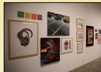
MFAH wall features work from teen artists throughout the nation.

https://www.mfah.org/visit/hours-and-admissions/ .