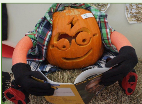
Pumpkin contest at AB School East promotes teamwork.