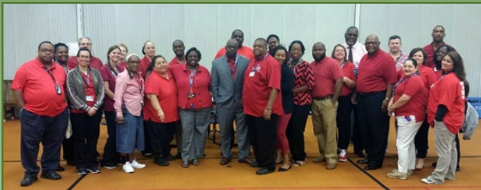
Highpoint School East staff wear red to stand against drug use.

Red Ribbon Week is a longstanding campaign to show solidarity against drug use. It began in Mexico City when drug traffickers murdered a DEA agent in 1985. Since then, red ribbons have represented a visible commitment for the creation of a drug-free America. National Red Ribbon Week is celebrated each year from October 23-31. The week also encourages themed dress to unify students and staff.